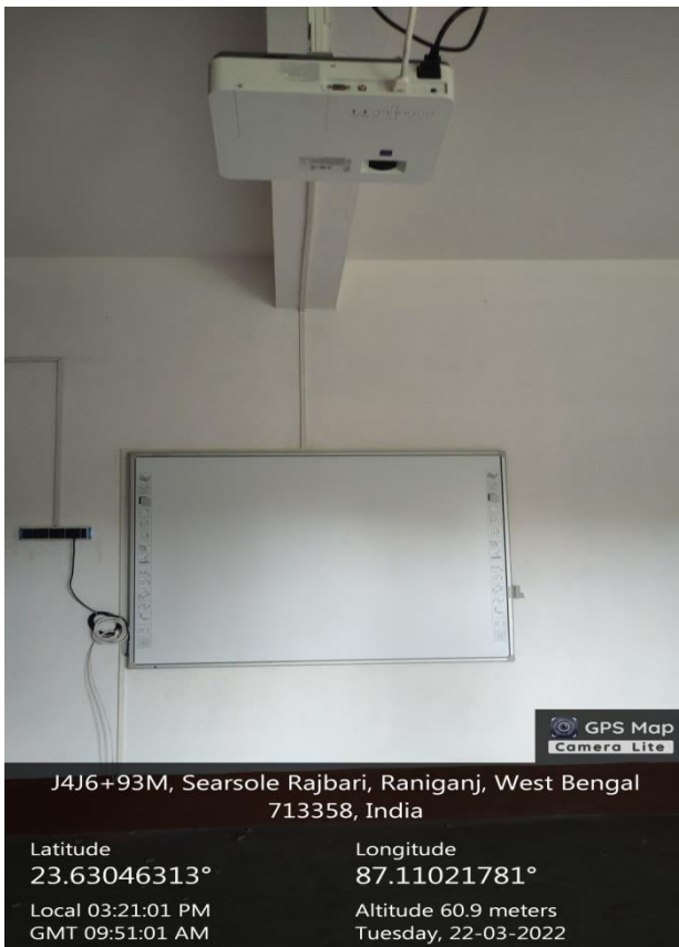
Room No. V204: Department of Commerce