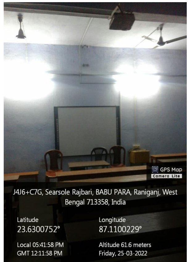
Room No. S2